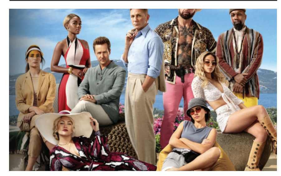
LA WEEKLY FILM REVIEWERS